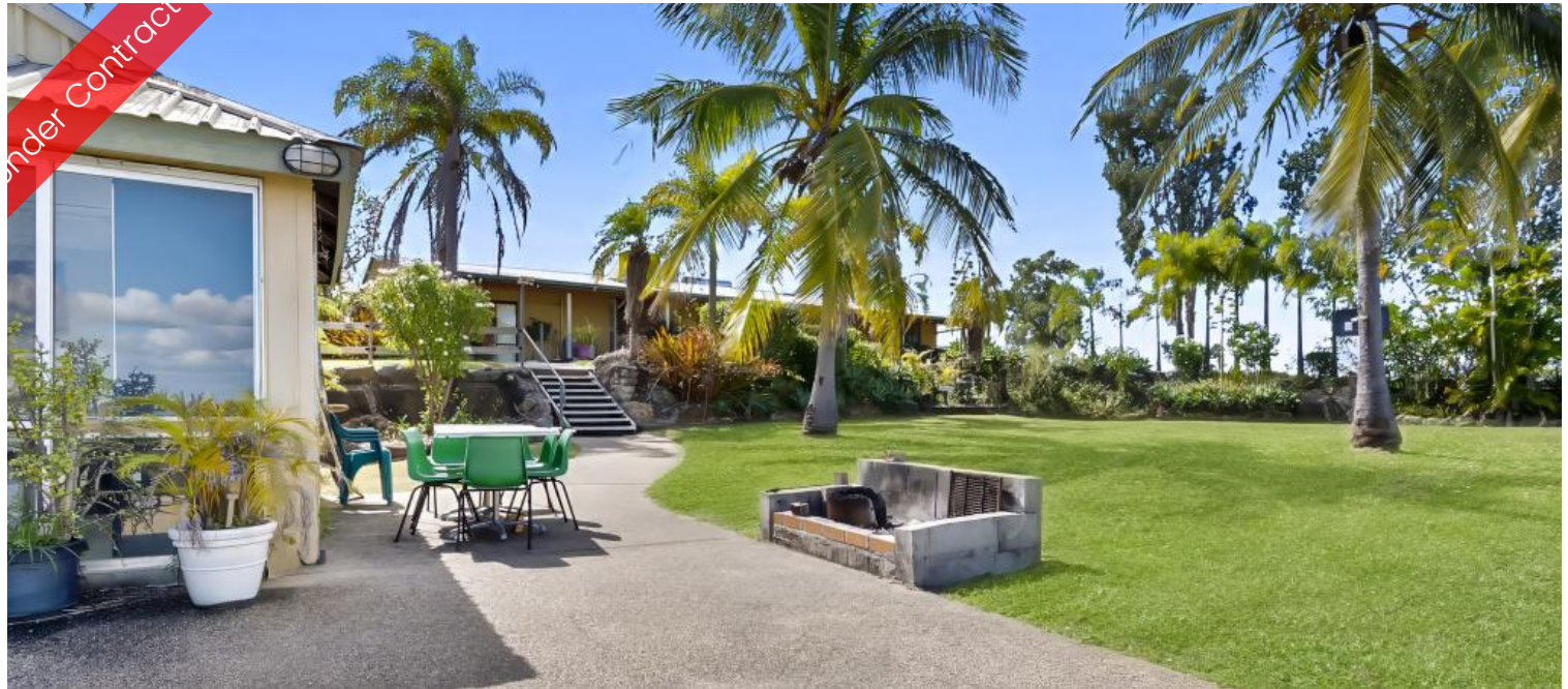
40 Neslein Rd, Glendale