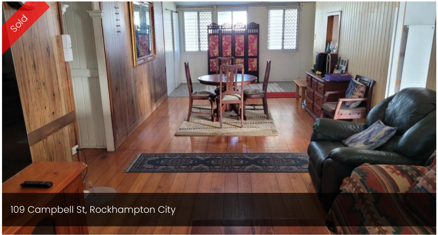
109 Campbell St, Rockhampton City