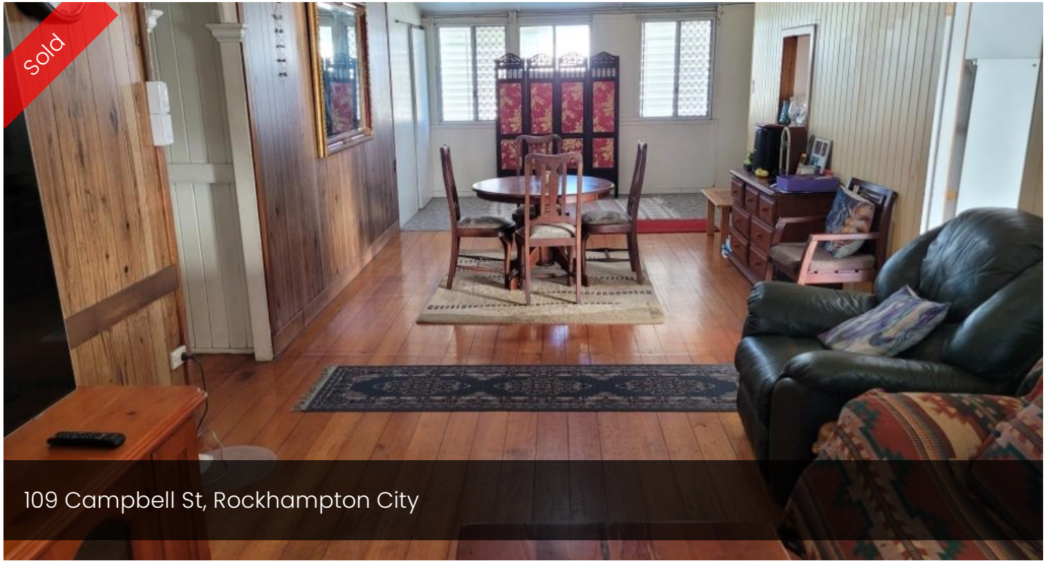
109 Campbell St, Rockhampton City