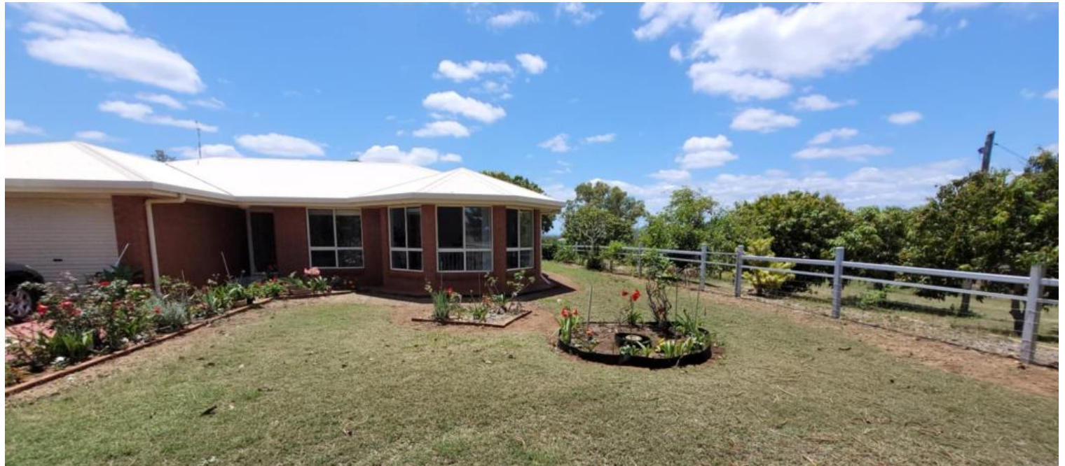
177 Raspberry Creek Rd, Kunwarara