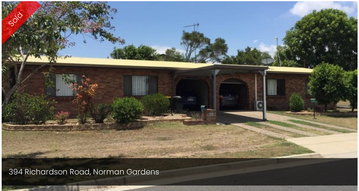
394 Richardson Road, Norman Gardens