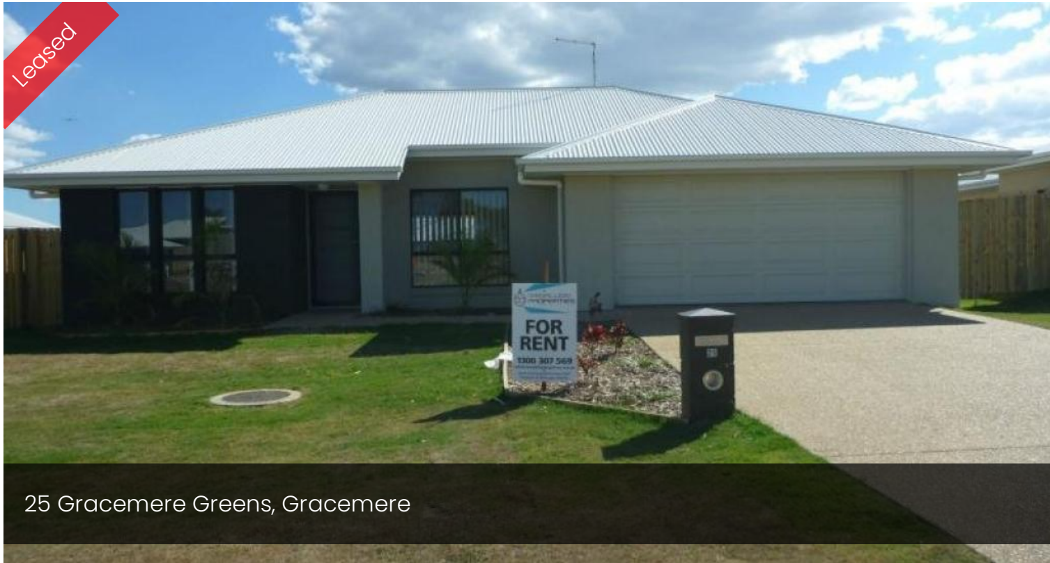
25 Gracemere Greens, Gracemere