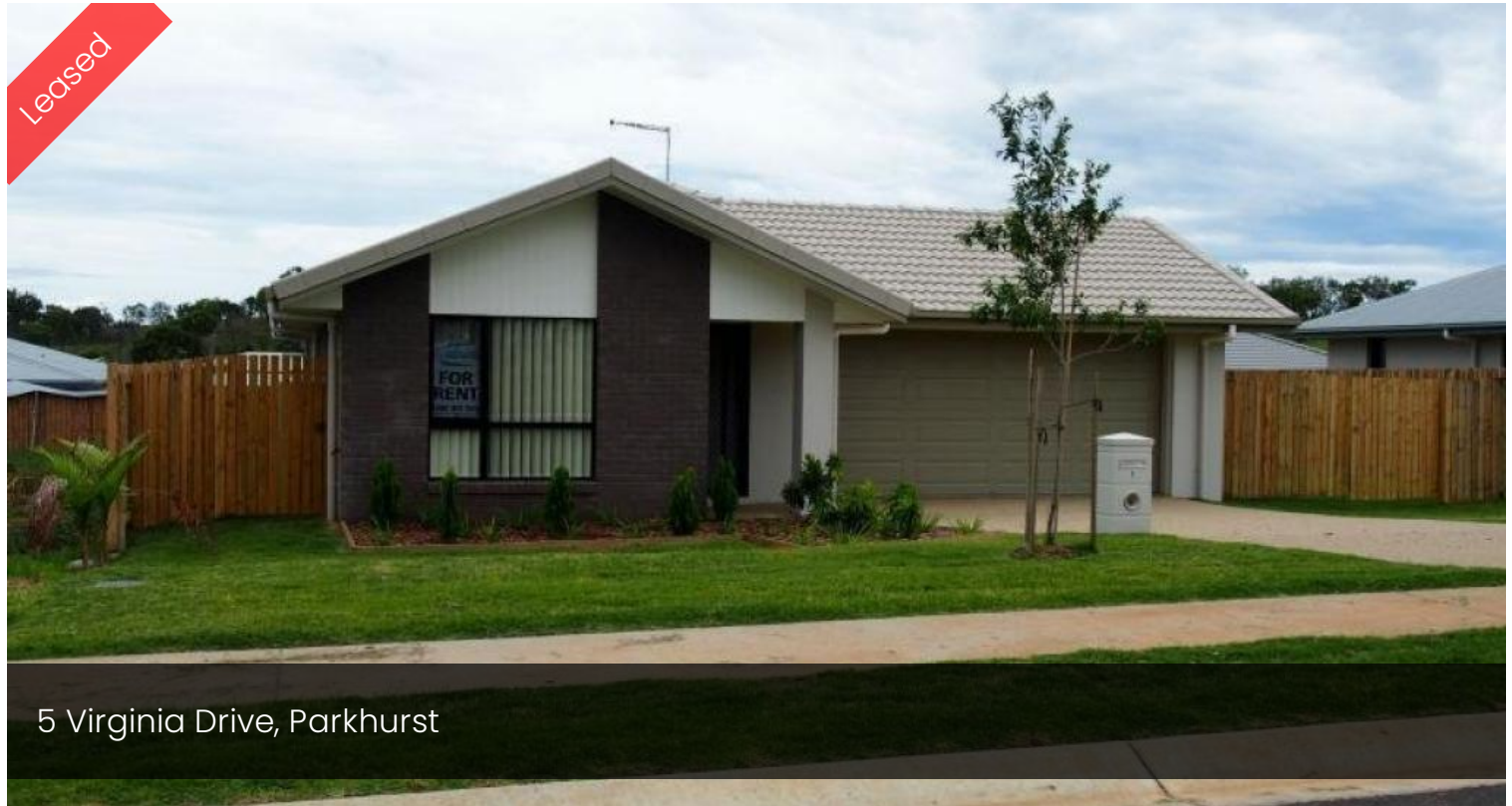
5 Virginia Drive, Parkhurst