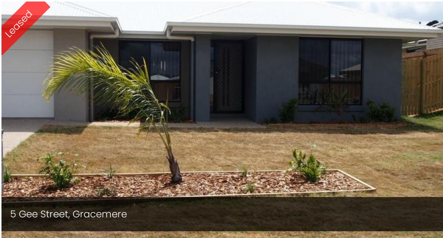
5 Gee Street, Gracemere