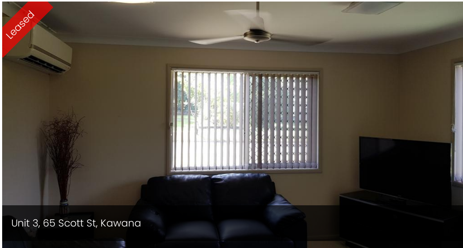
Unit 3, 65 Scott St, Kawana