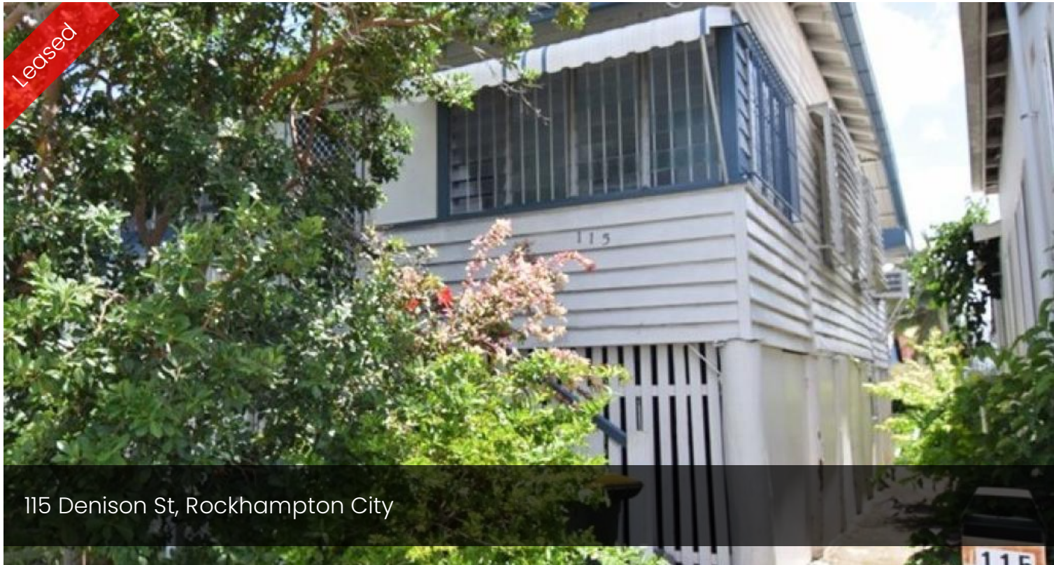
115 Denison St, Rockhampton City