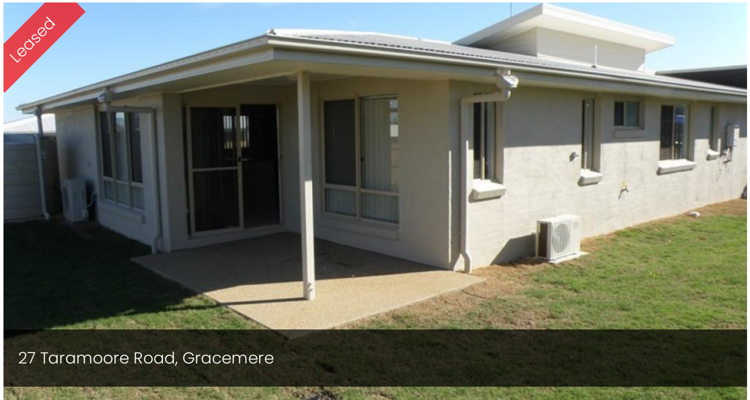
27 Taramoore Road, Gracemere