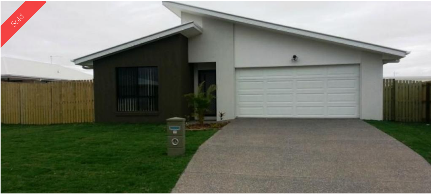
11 Marc Cres, Gracemere